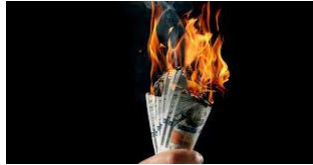
COSTS OF LITIGATION

The role of the City Attorney is also a preventative one. How to guide the client through possible disputes to avoid costly litigation.